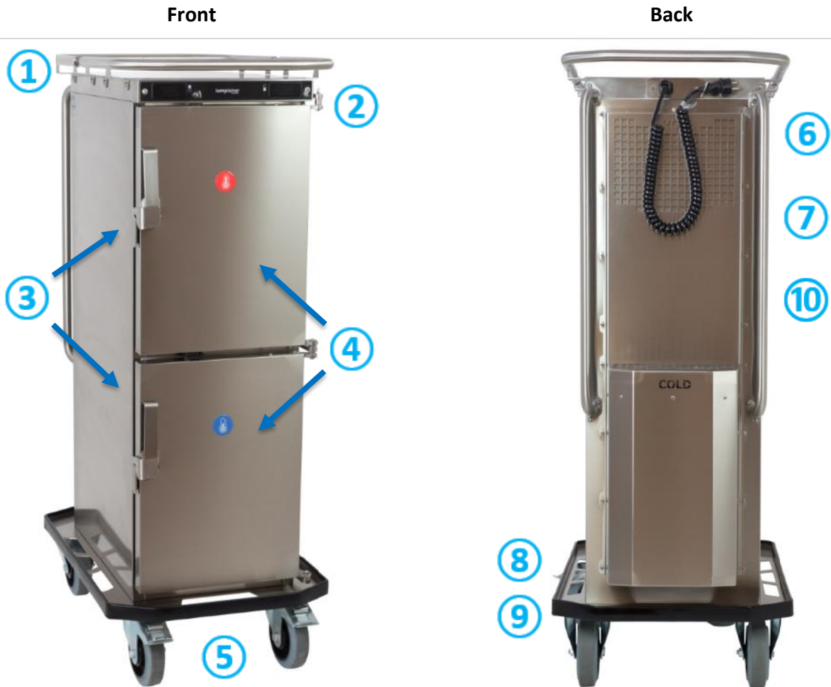
Figure 1. Temptainer Premium Tower model with active heating ( H ) and active cooling ( CC ).

The Twin trolley has double compartments next to each other. The compartment can be combined in any way for cold ( CC, C ), hot ( H ) or neutral ( N ) storage.